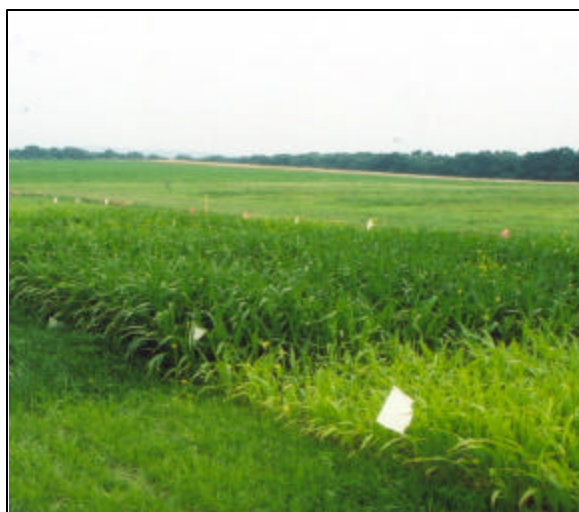
Figure 1: 2002 brown mid rib sorghum sudangrass N*K trial at Mt Pleasant, NY.

In the 2002 growing season, we conducted a study at the Mt Pleasant Research Farm in Tompkins County, NY. The soil was a silt loam Bath-Volusia soil, representative of a large portion of Southern Tier New York soils. The pH of the soil was 6.2 and the soil